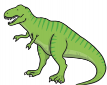
I am a Tyrannosaurus rex!