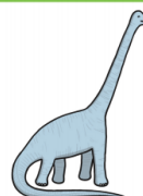
I am a Brachiosaurus!

Test your knowledge of dinosaurs by matching the descriptions to the correct pictures.