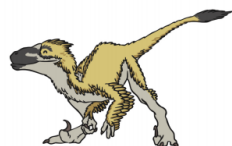
I am a Velociraptor!