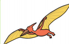
I am a Pterodactyl!