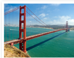
Golden Gate Bridge