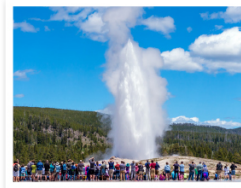
Old Faithful geyser