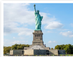
Statue of Liberty