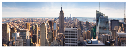
New York City skyline

New York City was the former capital of the USA and is in the south-east of New York state. It is made up of the five boroughs of Manhattan, Brooklyn, the Bronx, Queens and Staten Island. People from around the world visit New York City to experience the rich culture and enjoy its famous landmarks, such as Times Square, Central Park and the Statue of Liberty.