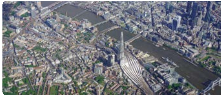
Aerial view of London

A city is a large, busy settlement where lots of people live and work. A city usually has a cathedral, a river, important buildings and offices where people work. There are lots of things to see and do in a city. There are many shops and restaurants to visit.