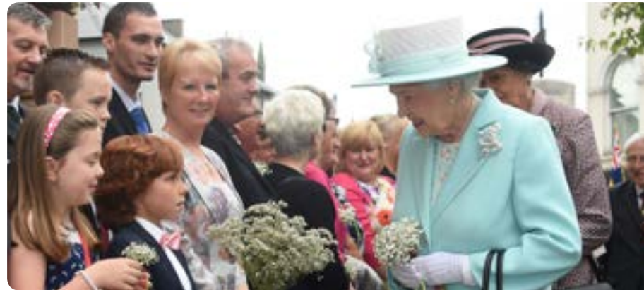
The Queen meets lots of people.

Elizabeth II is the Queen of the United Kingdom. She was born in 1926 and became queen in 1952. The Queen is married to Prince Philip and has a large family. She lives in Buckingham Palace in London. The Queen is very important. She visits charities and schools in the United Kingdom and welcomes world leaders to Buckingham Palace.