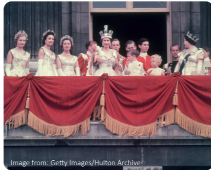
Queen Elizabeth II on her coronation.

A coronation is a ceremony where the crown is placed on the head of the new king or queen. Elizabeth II was the Queen of the United Kingdom for 70 years until she died in 2022. The coronation ceremony of Elizabeth II took place on 2nd June 1953 at Westminster Abbey, London. Many people celebrated the coronation by holding street parties.