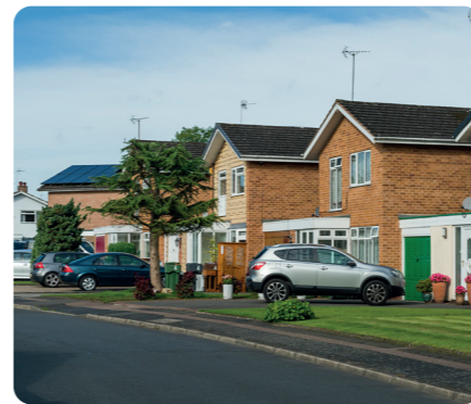
A street today.