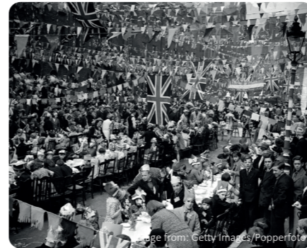
Street party to celebrate the coronation.