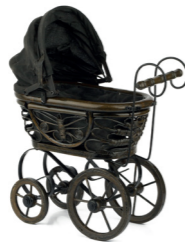
wood and metal pram