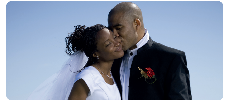
Weddings happen when two adults get married.