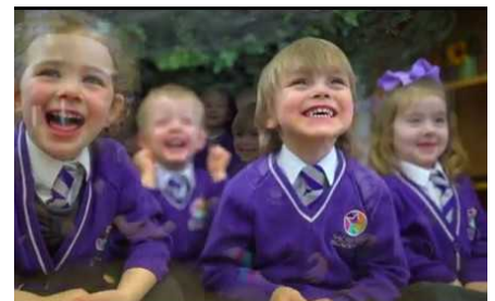
Making our school video