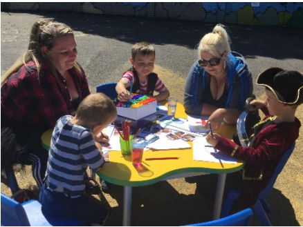
Parents and Pirates