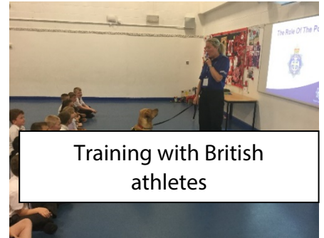
Training with British athletes