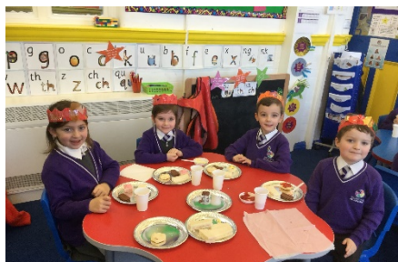
Royal Tea Party