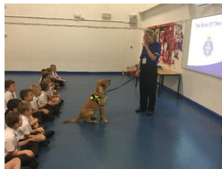
Animals who help us in our community