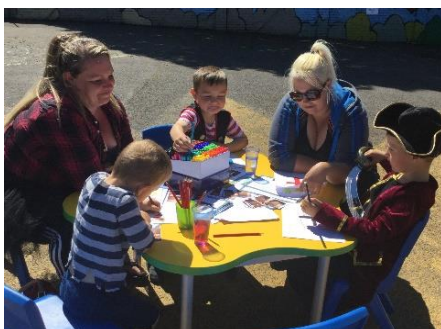
Parents and Pirates