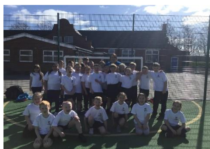
Training with British athletes