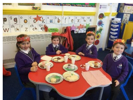
Royal Tea Party