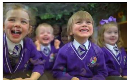
Making our school video