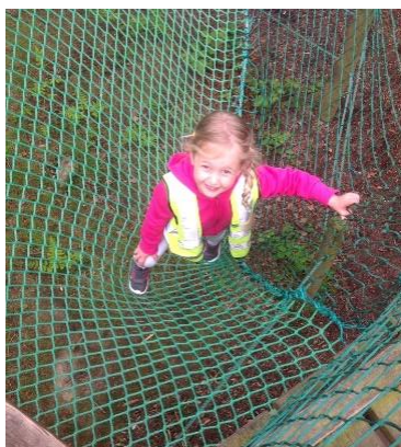
Captain Cook Museum